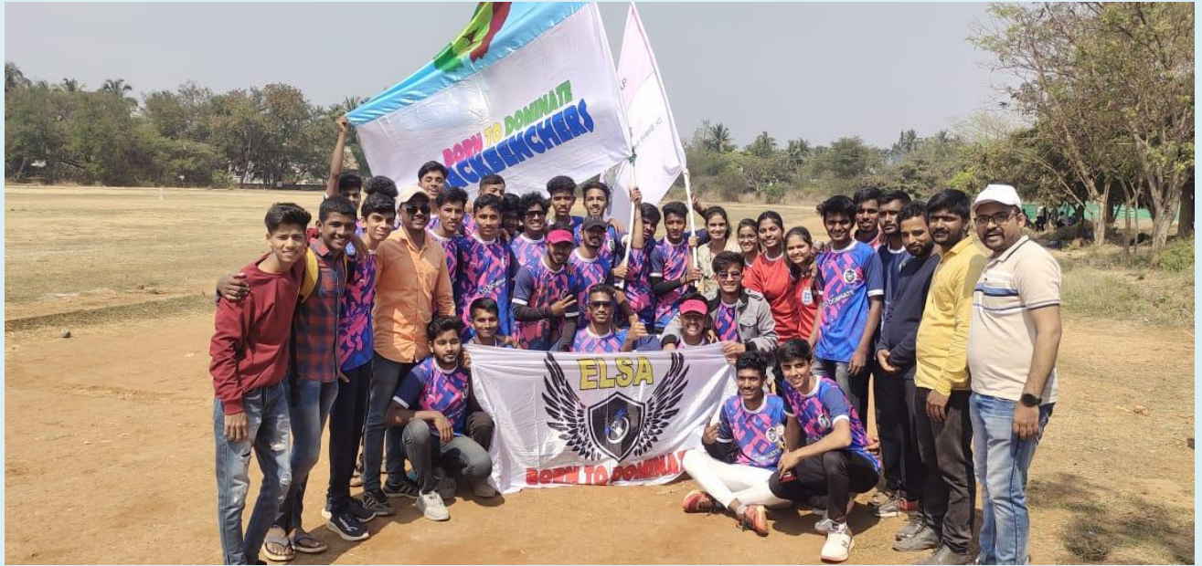
WINNING MOMENT AT ANNUAL SPORTS - 2023