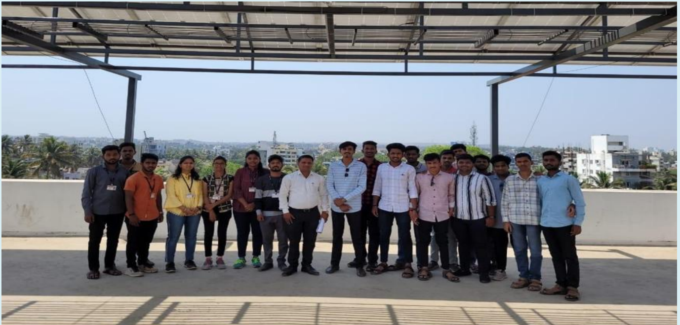
Industrial Visit to “Suntake Solar System”