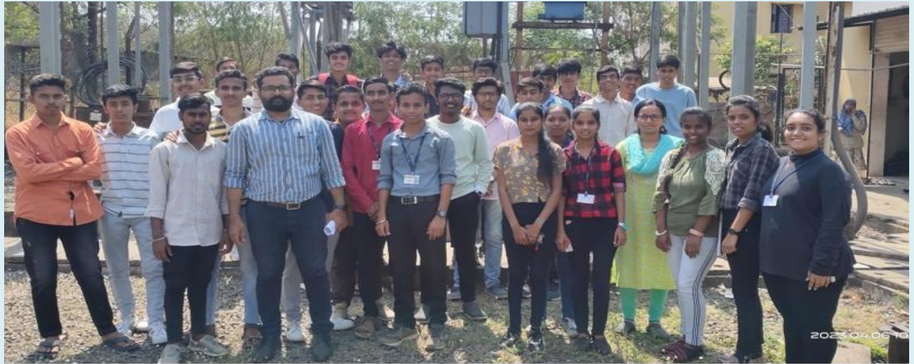
Industrial Visit to “33 KV MSEDCL Substation, Shivaji University”