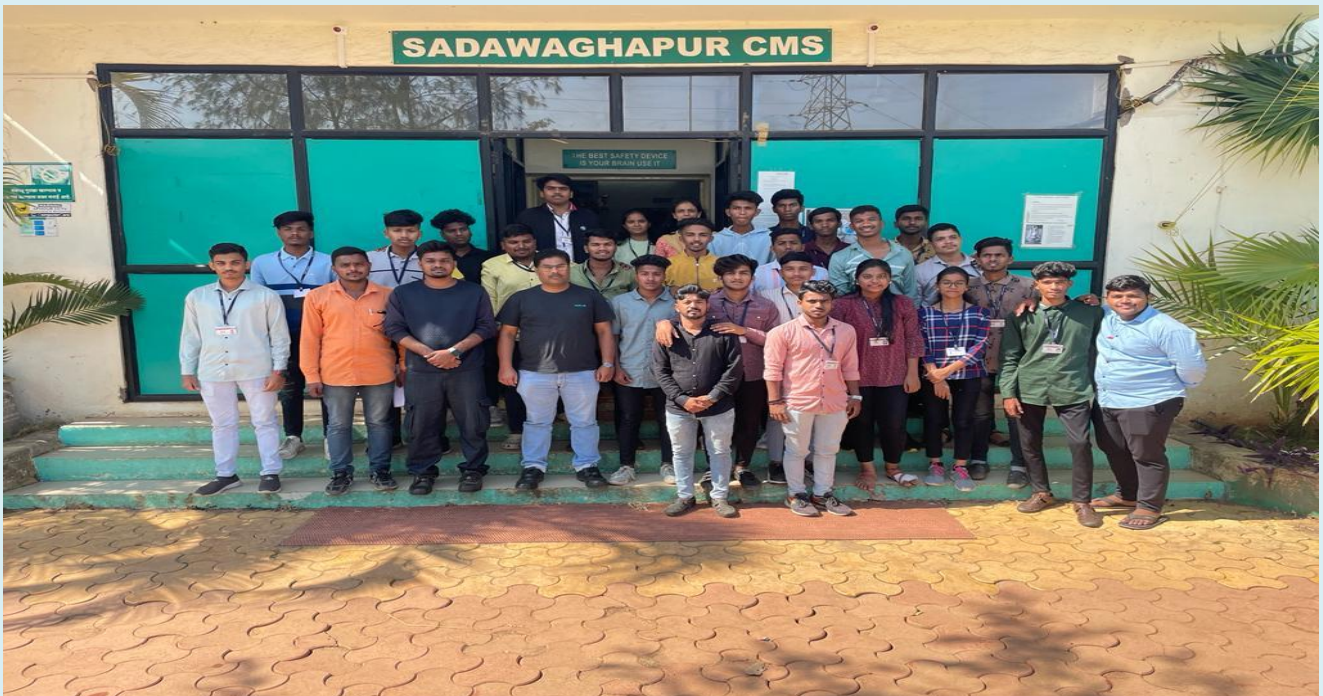
Industrial Visit to Suzlon Energy PVT. LTD. Satara