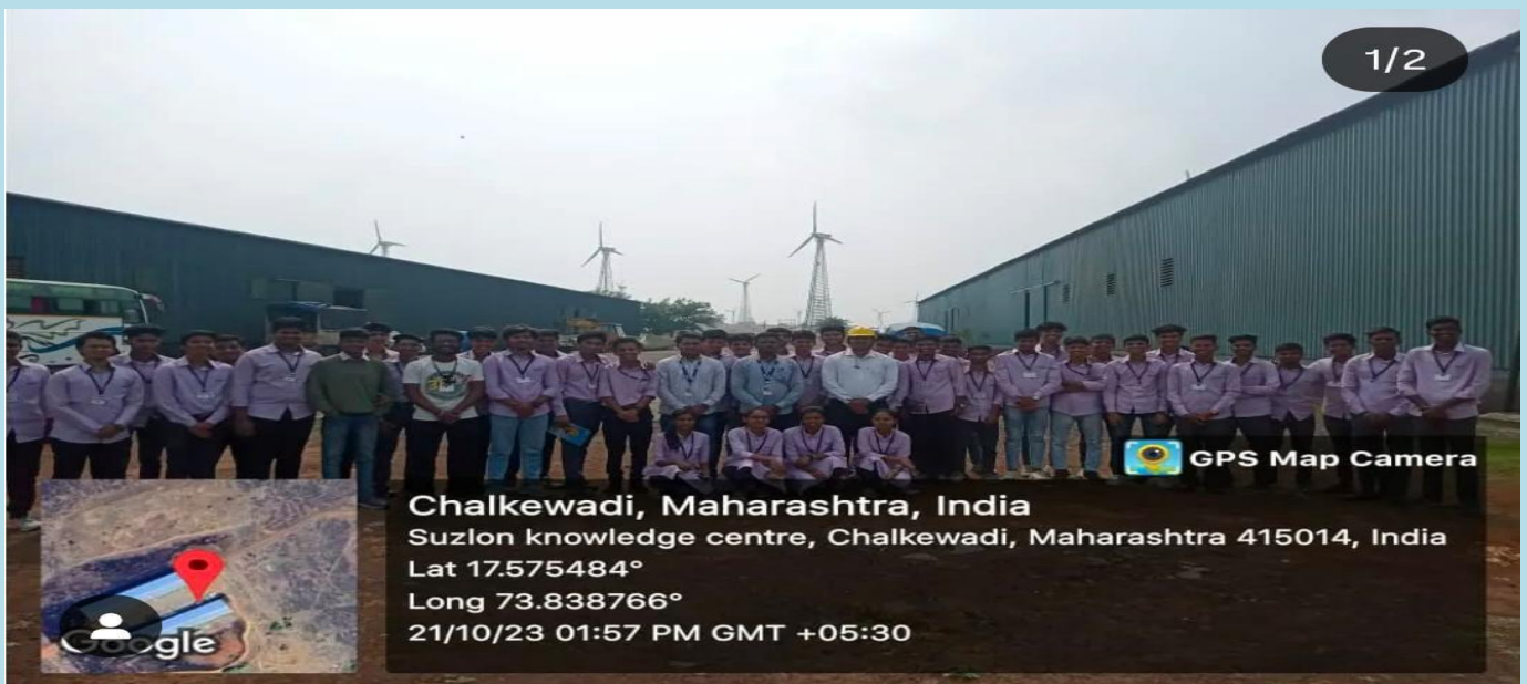
Industrial Visit to Suzlon Knowledge Center, Chalkewadi, Satara.