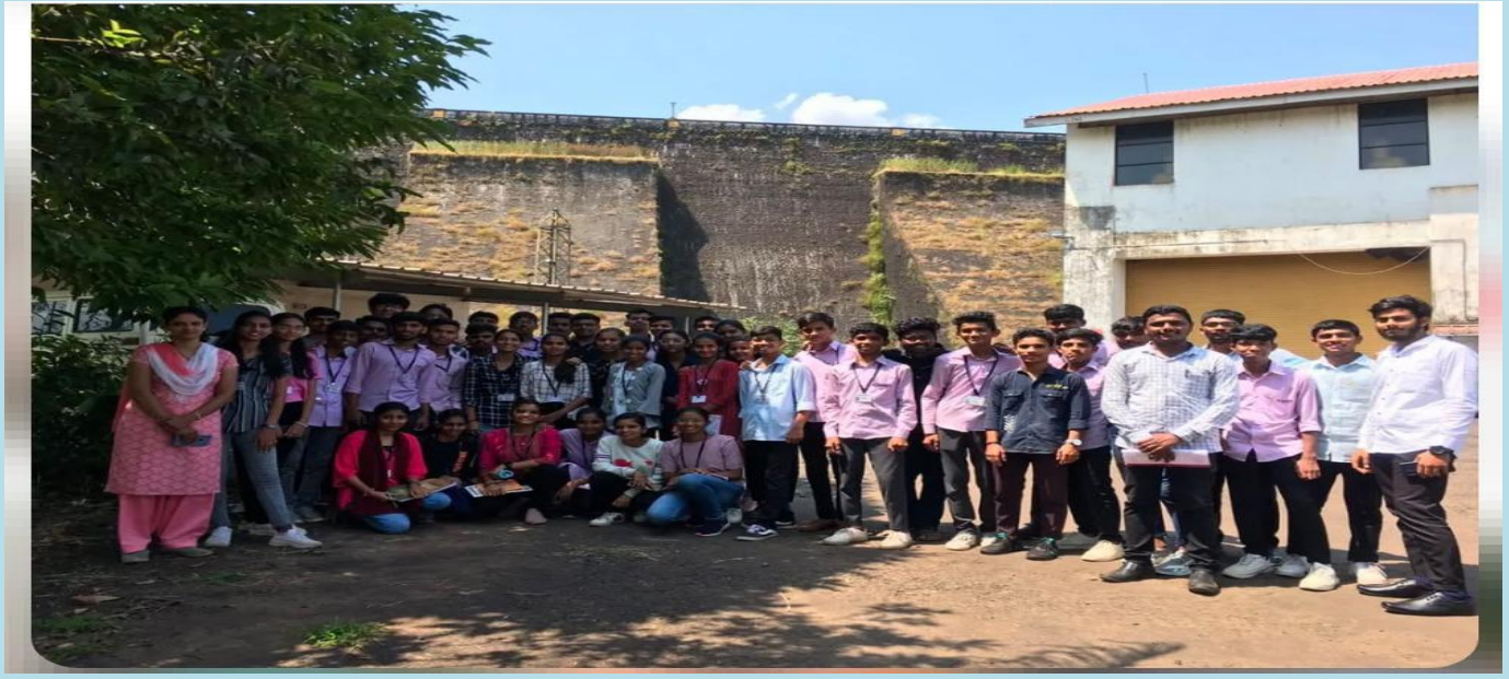
Industrial Visit to R. M. Mohite Power House, Radhanagri